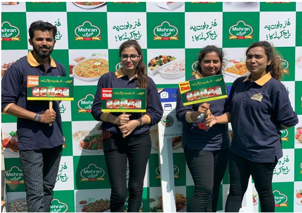
Mehran Spices team performing fun filled activities at JUW