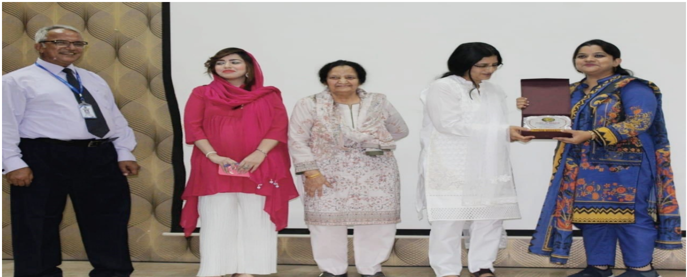
Shield-giving ceremony to guest speakers on the World Food Day

“Everything in food is science. The only subjective part is when you eat it” -- Alton Brown